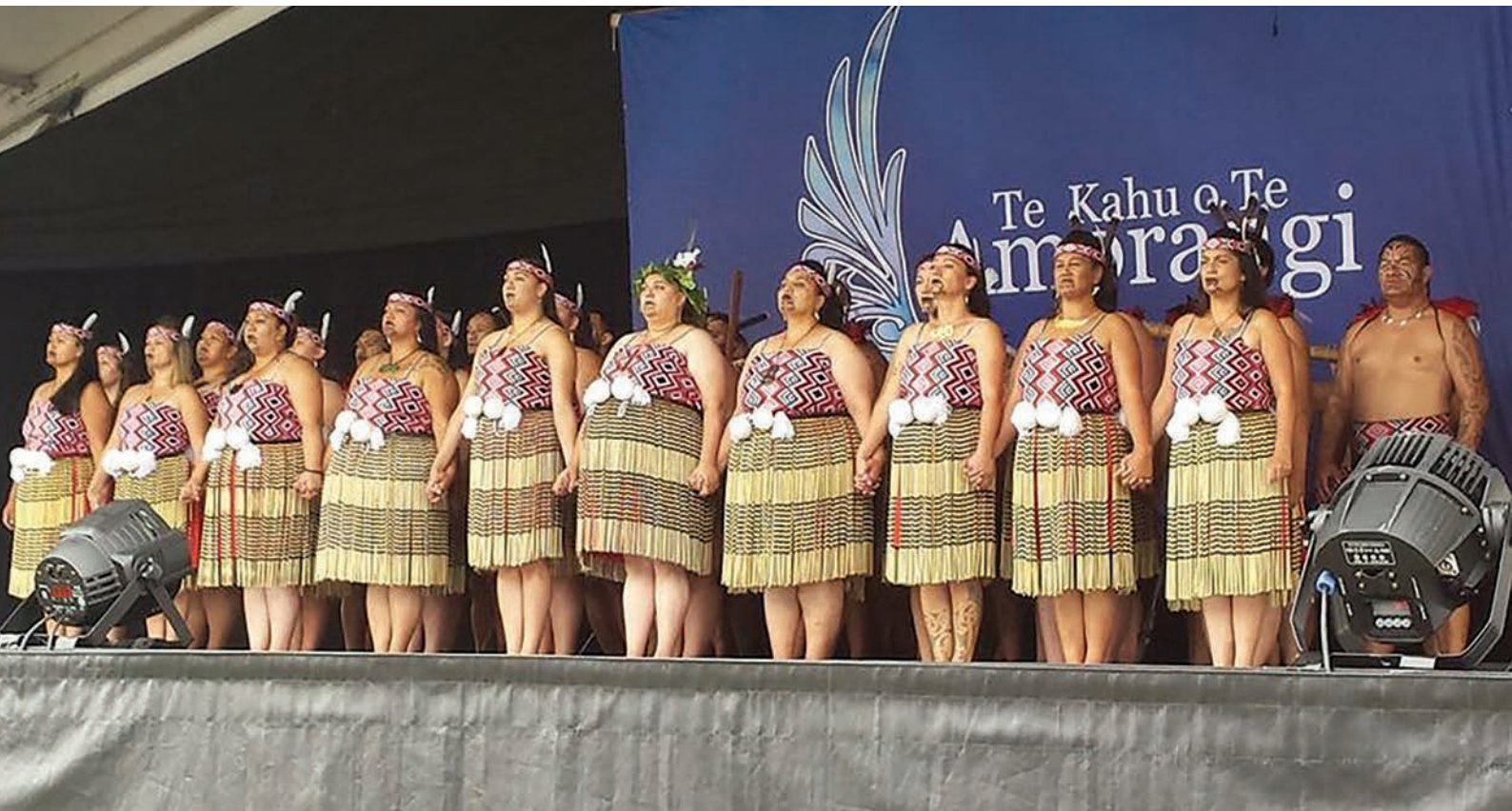
Te Rerenga Kotuku senior Kapa, winners of the regional 2018 Ngati Kahungunu Te Kahu O Te Amorangi competition.